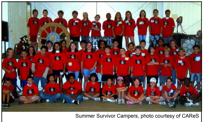
Summer Survivor Campers

The Kaleigh Wilday Endowment and the Community Fund together granted the Council on Addiction Recovery Services $1,000 toward the operation of their Summer Survivor Day Camp. The Community Fund also helped Rebuilding Together with a $1,000 grant to offset the costs of a home's repairs.